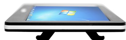
UM-760RF front and side views